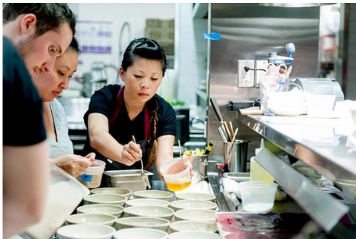
Top Chef Mei Lin Eats at These Restaurants When She's Craving Awesome Chinese Food