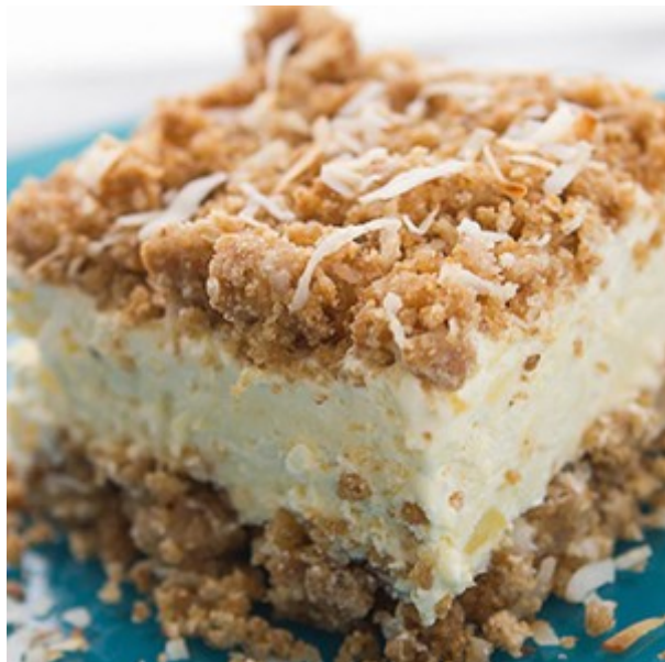
The Best Dessert You've Never Heard Of