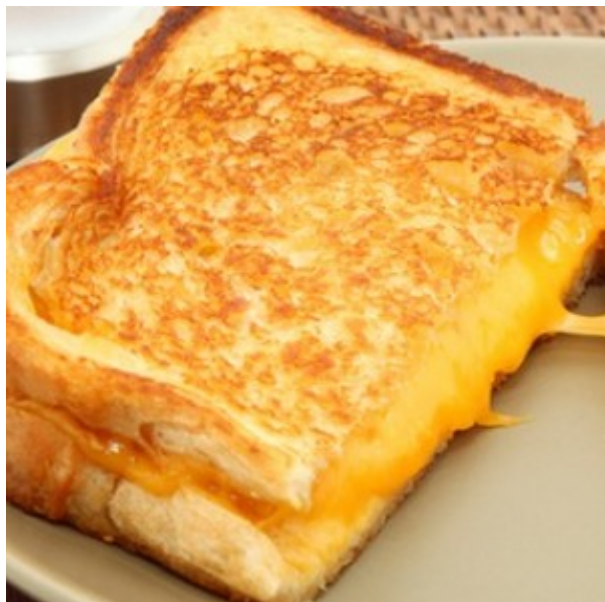
Skip the Butter and Use This on Your Grilled Cheese Instead