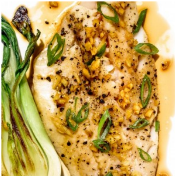
6 Fast and Delectable Whitefish Recipes for Summer