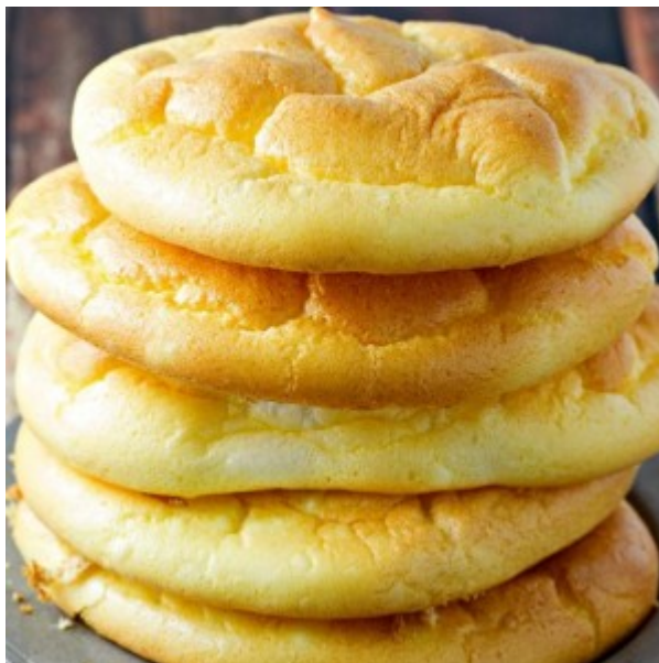
The Cloud Bread Recipe Everyone's Been Asking For