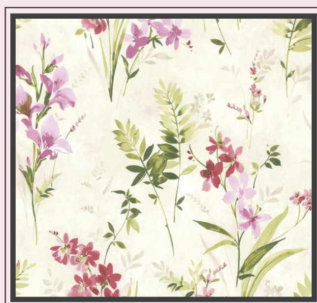
Pink Driselle Floral Wallpaper Model Number: 2686-21627

You can enhance the rustic charm of your home by hanging shelves with reclaimed wood. Add tables or stands with woven baskets to hold gloves and hats, and finish with a floral print inside an antiqued wooden frame.