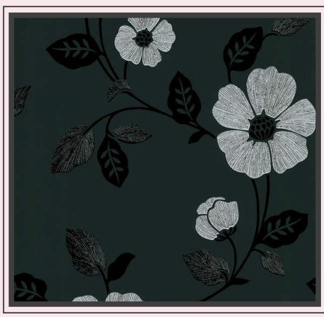
Black Modern Floral Wallpaper Model Number: 426-6289

For an easy DIY project, start small, like with a half bath.