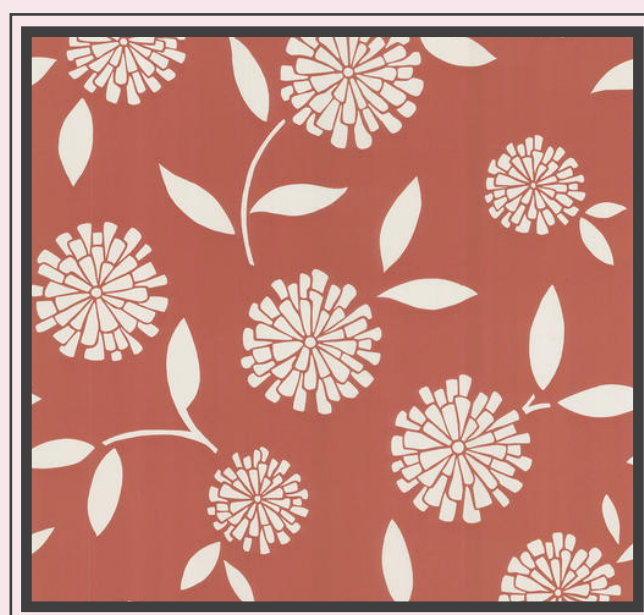
Red Modern Floral Wallpaper Model Number: 425-6046

You can also enrich the wallpaper design with a floral comforter or add a couple floral throw pillows to complete your new room décor.