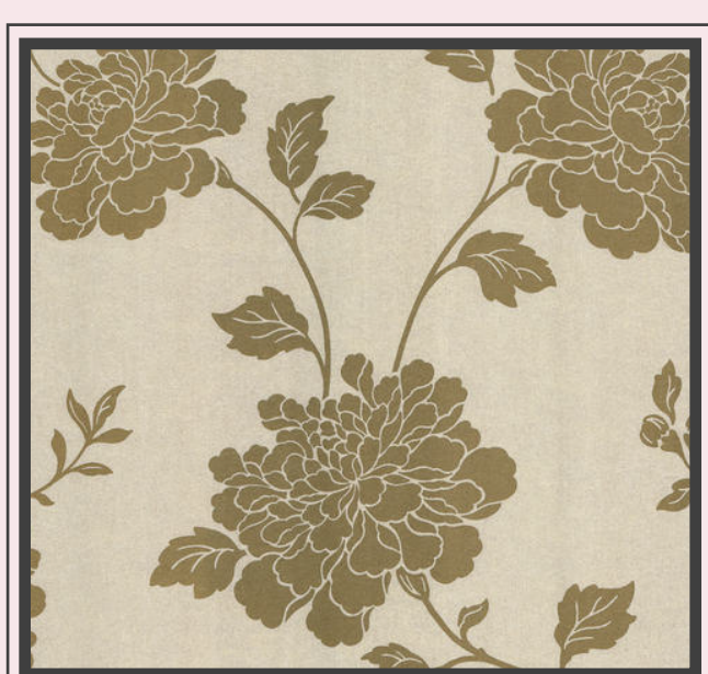
Gold Modern Floral Wallpaper Model Number: 435-8055

Liven up your living room by wallpapering the largest wall. The wall near your sofa or other showstopper furniture is best.