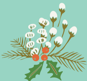
Faux Berry and Mitsumata Branches