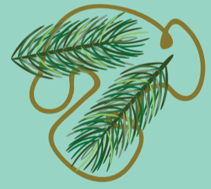
Garland and Vines