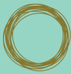
18-gauge Copper or Stainless Steel Wire