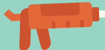
Hot Glue Gun