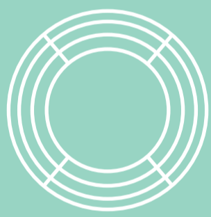
18-gauge Wire Frame

You can find everything with a single trip to your local home improvement center: