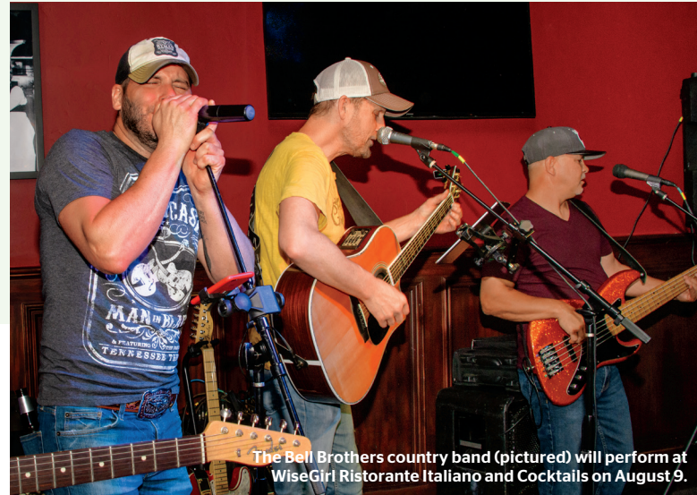
The Bell Brothers country band (pictured) will perform at WiseGirl Ristorante Italiano and Cocktails on August 9.