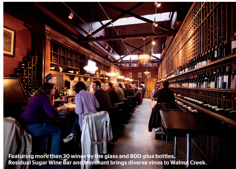
Featuring more than 30 wines by the glass and 800-plus bottles, Residual Sugar Wine Bar and Merchant brings diverse vinos to Walnut Creek.