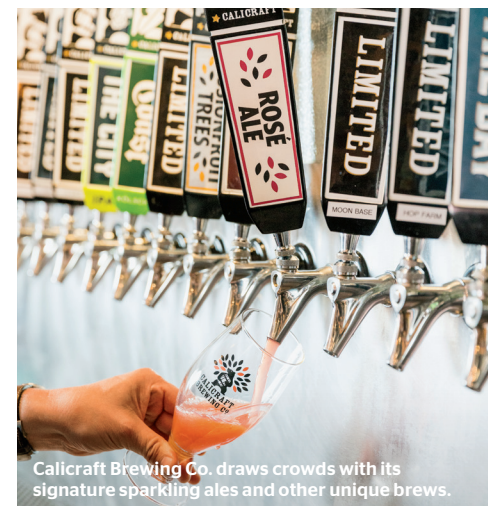
Callcraft Brewing Co. draws crowds with its signature sparkling ales and other unique brews.

Drink (and eat) like a sailor during the daily Skippers' Meeting (aka happy hour) at this nautically themed seafood eatery. Sidle up to the main bar or oyster bar between 3 and 6 p.m. to enjoy $5 craft beers, $6 well drinks and select wines by the glass, and discounted house cocktails. (Try the famous mai tai.) As you imbibe, munch on mahimahi tacos, the juicy Black Angus burger, or the fried chicken sandwich. Note that the Skippers' Meeting is only open to "members," so if you're not one already, sign up at the restaurant for free to join in on the fun. Walnut Creek, wyc.net. —A.S.