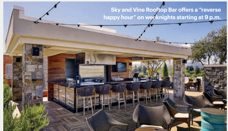
Sky and Vine Rooftop Bar offers a "reverse happy hour" on weeknights starting at 9 p.m.

Indulge in a little retail therapy (and walk off that wine) by exploring First Street's boutiques. Browse for fashions at State and First by Maris Collective , treat yourself to a statement piece at Napa Valley Jewelers , or head to Napastäk