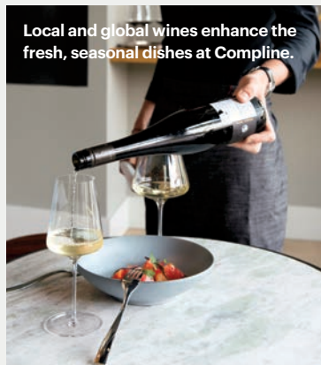
Local and global wines enhance the fresh, seasonal dishes at Compline.

End the evening at Archer's buzzy Sky and Vine Rooftop Bar , where you can take in the 360-degree view as you sip specialty cocktails. It's the perfect spot to raise your glass and toast to a beautiful weekend in Napa. archerhotel.com/napa .