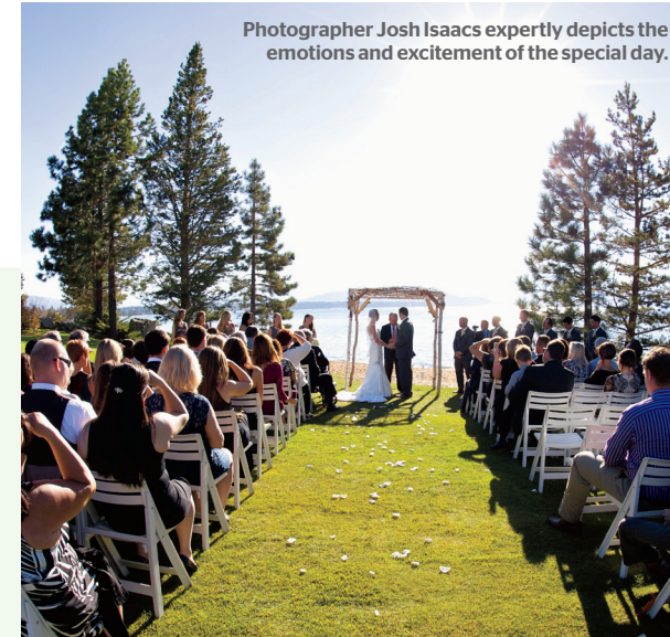
Photographer Josh Isaacs expertly depicts the emotions and excitement of the special day.

trends and fashions during your VIP appointment—a two-hour session that includes a mimosa bar with two bottles of champagne and bride-approved snacks for you and your bridal tribe, plus 10 percent off your purchase. The Kinsley James team can also help you find top-notch wedding vendors to make your nuptials perfect, offering recommendations for florists, event designers, photographers, and more. Walnut Creek, kinsleyjames.com. —K.H.