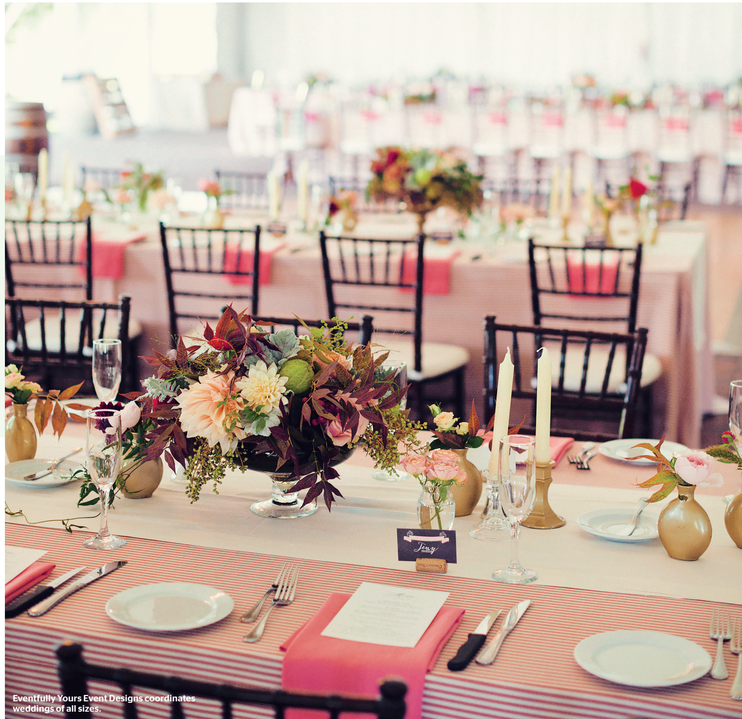
Eventfully Yours Event Designs coordinates weddings of all sizes.

➔ Take the jitters out of tying the knot with help from these nuptial experts, who ensure