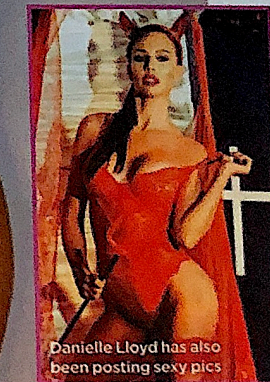
Danielle Lloyd has also been posting sexy pics