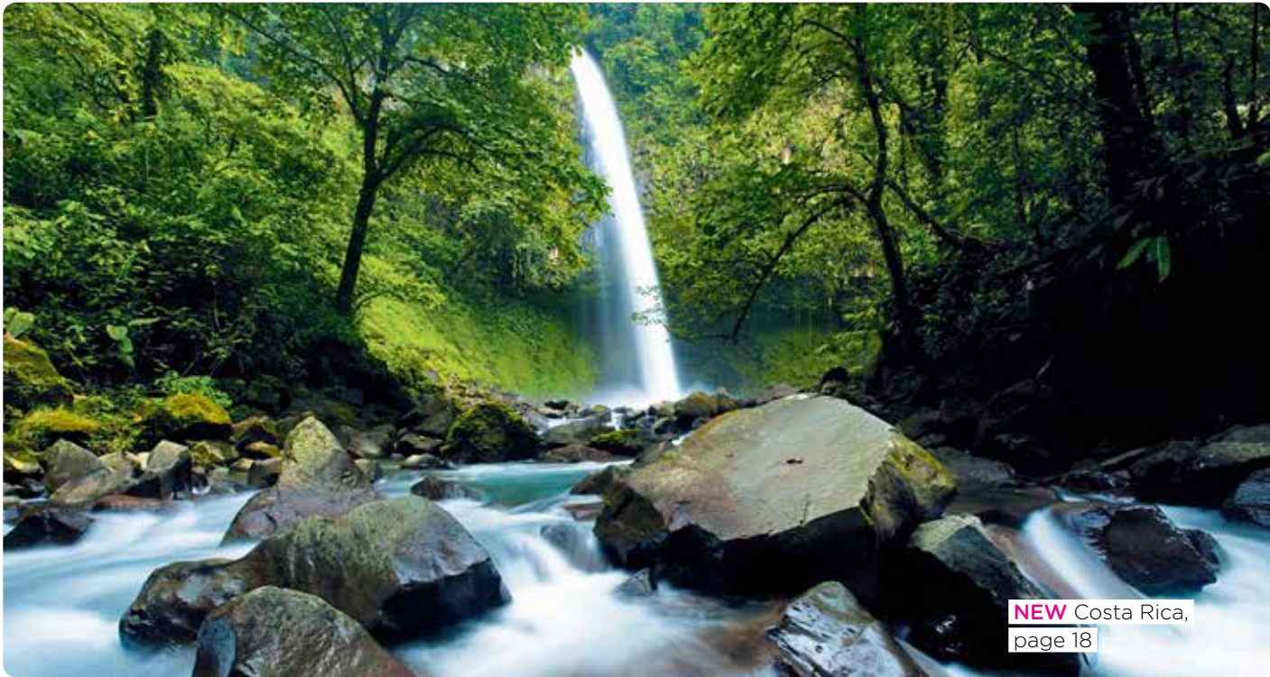
NEW Costa Rica, page 18

Need-to-know info about First Choice holidays