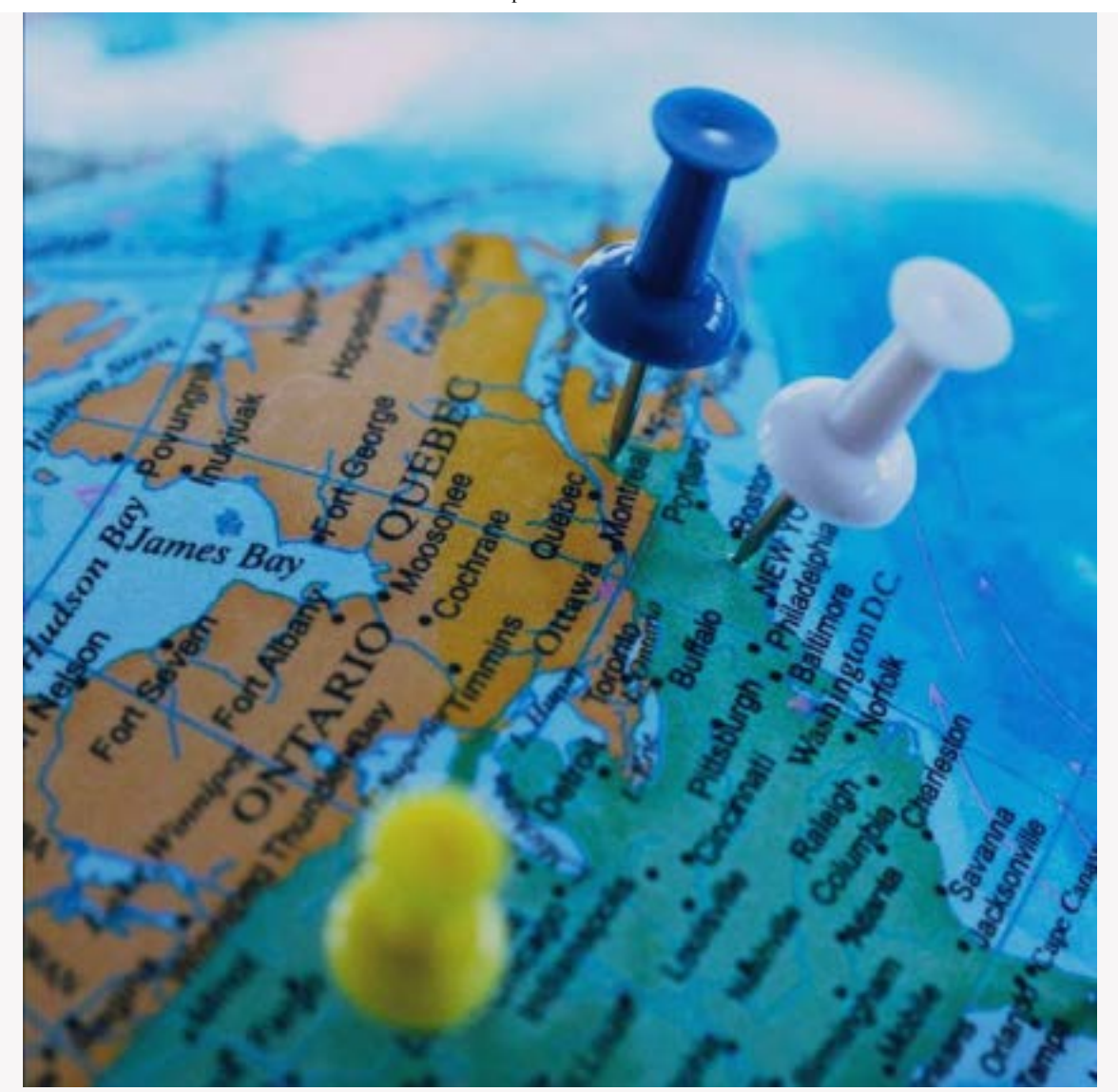
Welcome back to East Coast Roasts , a monthly newsletter dedicated to keeping our East Coast roasters in the know!