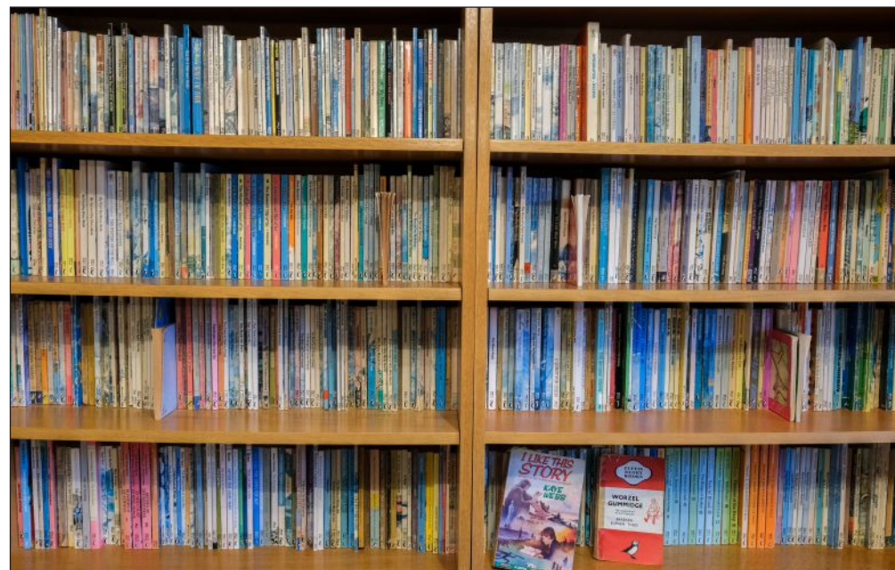
Shelves and shelves of Puffins!