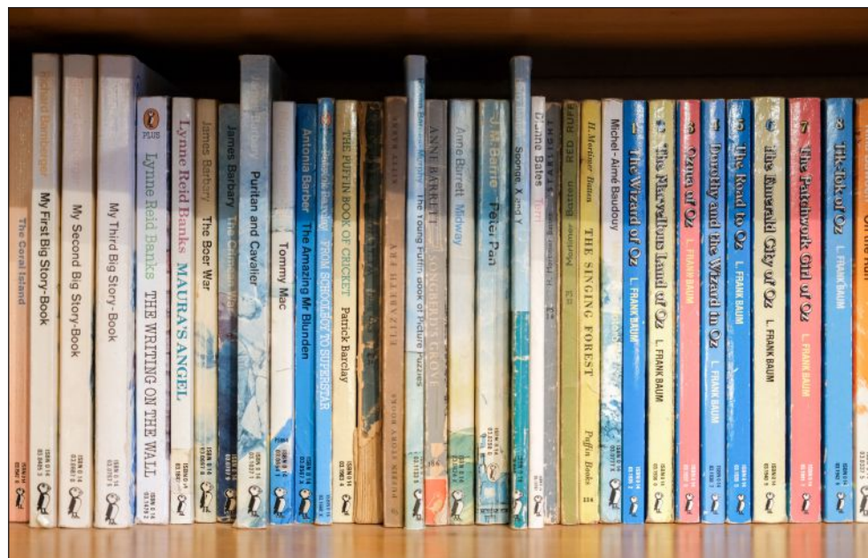
The first 200 Puffin books