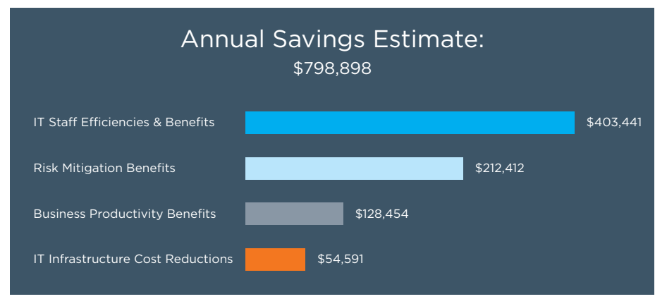
Figure 1. A summary of return on investment using the ForeScout Business Value ROI Tool (based on IDC methodology), as determined by the county's Office of Internet Technology.

Translated into business value, ForeScout's calculations indicate that Prince George's County will realize substantial cost savings in multiple areas. Annual savings are estimated at $798,898, broken down as follows: