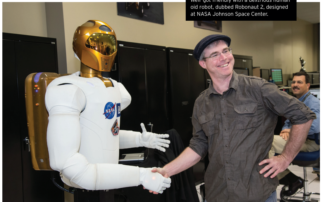
Weir got friendly with a dextrous humanoid robot, dubbed Robonaut 2, designed at NASA Johnson Space Center.

But there is one problem with that: Weir is terrified of flying. That's probably the biggest difference between him and Watney. (continued on pg. 104)