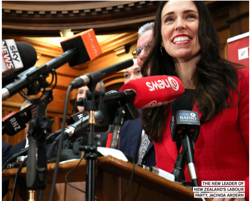
THE NEW LEADER OF NEW ZEALAND'S LABOUR PARTY, JACINDA ARDERN