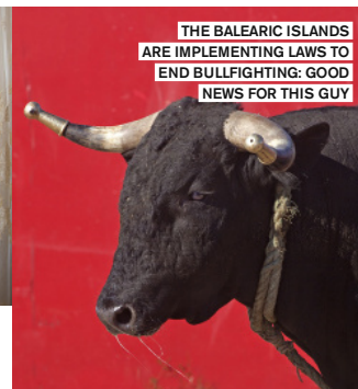
THE BALEARIC ISLANDS ARE IMPLEMENTING LAWS TO END BULLFIGHTING: GOOD NEWS FOR THIS GUY