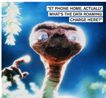
"ET PHONE HOME. ACTUALLY WHAT'S THE DATA ROAMING CHARGE HERE?"