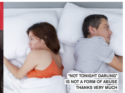
"NOT TONIGHT DARLING" IS NOT A FORM OF ABUSE THANKS VERY MUCH