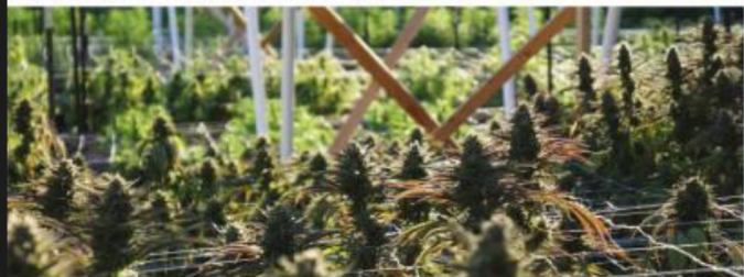
"During the frenzied transition prior to 2018, a few local cannabis companies cultivators and product-makers stand out." —Samantha Campos