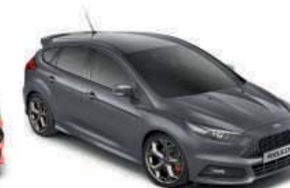
Stealth ** Solid body colour