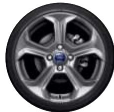
17" Flash Grey alloy wheel. (Standard)