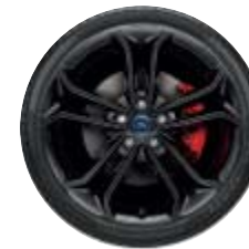
19" Black alloy wheel. (ST Black Style Pack)