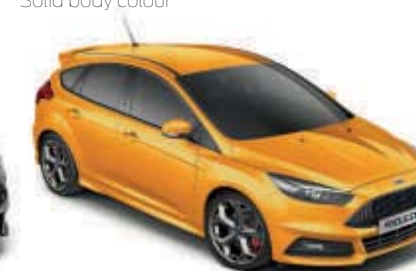
Tangerine Scream ** Tri-coat body colour 1