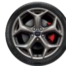
18" Rock Metallic alloy wheel (standard on ST-3)