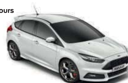
Frozen White Solid body colour 1