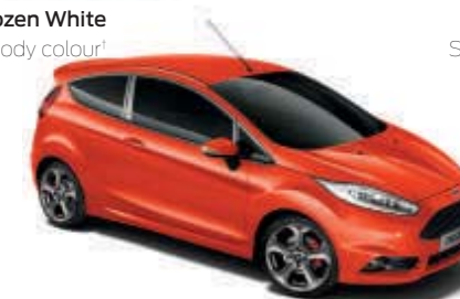
Molten Orange ** Pearlescent metallic body colour 1

1 Available at extra cost. ** Unique to ST vehicles. Ø Panther Black to be replaced by Shadow Black from 2016.5MY (Fiesta ST)