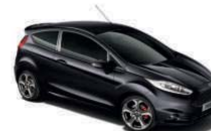
Panther Black Ø Metallic body colour 1