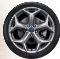
18" Flash Grey alloy wheel. (Standard ST-1 & ST-2 calipers)