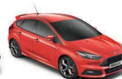
Race Red Solid body colour