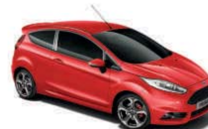
Race Red Solid body colour