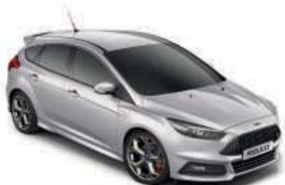
Moondust Silver Metallic body colour 1