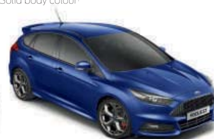
Deep Impact Blue Metallic body colour 1