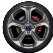
17" 5-spoke Rock Metallic painted alloy wheel (as part of ST Style Pack)