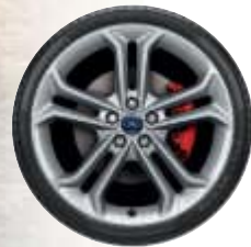
19" Silver alloy wheel. (ST Style Pack)