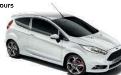
Frozen White Solid body colour 1