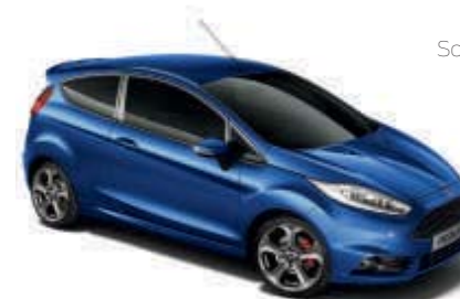
Spirit Blue ** Metallic body colour 1