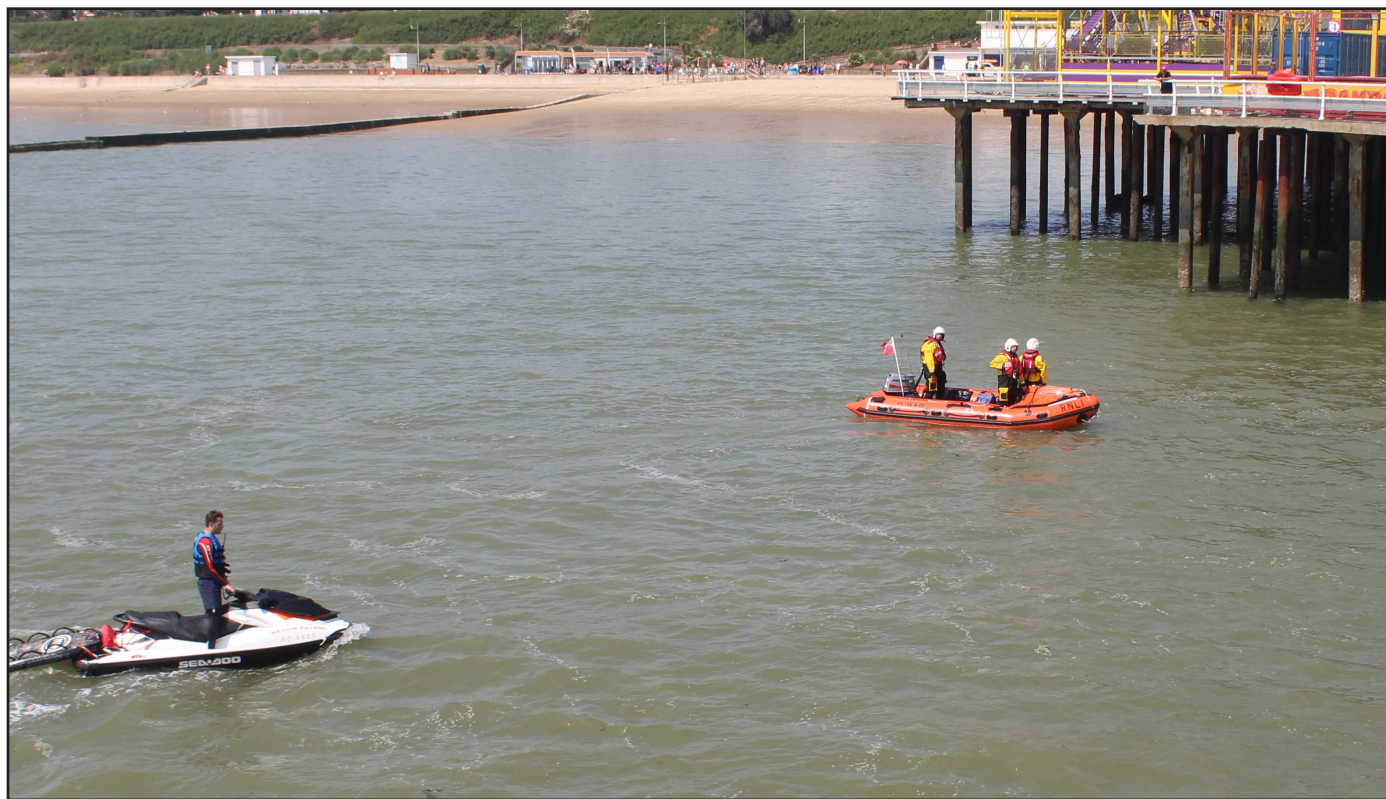
■ Rescue - Lifeboat crews and the beach patrol during the rescue at Clacton Pier