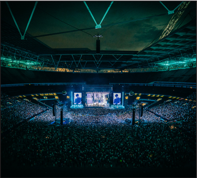
■ Special - Blur headlining Wembley

SAVE £££s NEW & IMPROVED READER REWARDS!