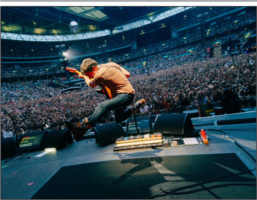
■ Rocker - Graham Coxon onstage at Wembley Stadium

Parklife (featuring a fantastic guest appearance from Phil Daniels), for example, sucker-punched relentless ripples through the entire stadium, and shockwaves through wider London, while Song 2 shook the foundations to its core.