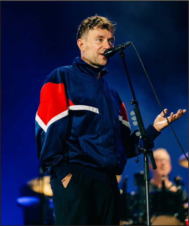
■ Icon - Colchester school boy Damon

As Damon said at the start, the four-piece had waited for this moment their entire lives. Well, if Blur's first Wembley Stadium headline gig is anything to go by, it really looks like they might have made it.