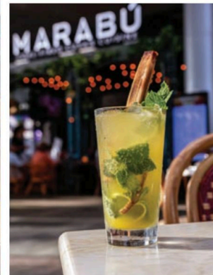
CLOCKWISE FROM FAR LEFT: HOTEL AKA BRICKELL'S PORTE COCHERE; BRICKELL CITY CENTRE; MOJITO AT MARABÚ INSIDE BRICKELL CITY CENTRE; LIGHT-FILLED INTERIORS AND GRILLED BRANZINO AT ADRIFT MARE; NEW TWENTY-FIFTH-FLOOR LOUNGE AT HOTEL AKA BRICKELL.