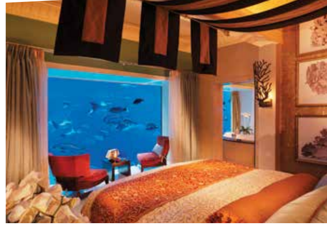
EXPLORE ARCHITECTURAL MARVELS LIKE THE BURJ KHALIFA (FAR LEFT) AND THE PALM, A MAN-MADE GROUP OF ISLANDS. THE PALM IS HOME TO ATLANTIS THE PALM. DUBAI. WHICH OFFERS UNDERWATER SUITES (ABOVE) AND THE ROYAL BRIDGE SUITE (LEFT).

odern-day Dubai emerges from the desert like a futuristic mirage Acres of chrome, steel, and glass have reclaimed sandy swaths