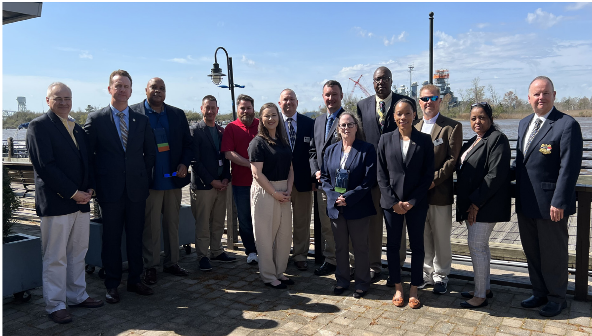
Members of the 2022-23 NCNGA Executive Council at Convention in Wilmington

children point them to the right direction with the resources they need to be able to solve their problems and any issues they may have.