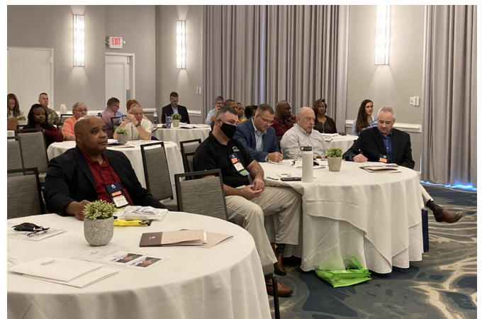
Members of the Association listening in to membership meeting at the Ballast Hotel in Wilmington, NC

State Outreach Coordinator for the North Carolina National Guard helps soldiers, family members, and their