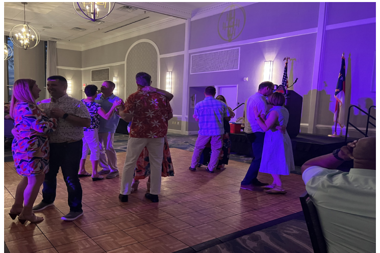
Members of the NCNGA enjoying Saturday night dinner and dancing at 2022 Wilmington Convention