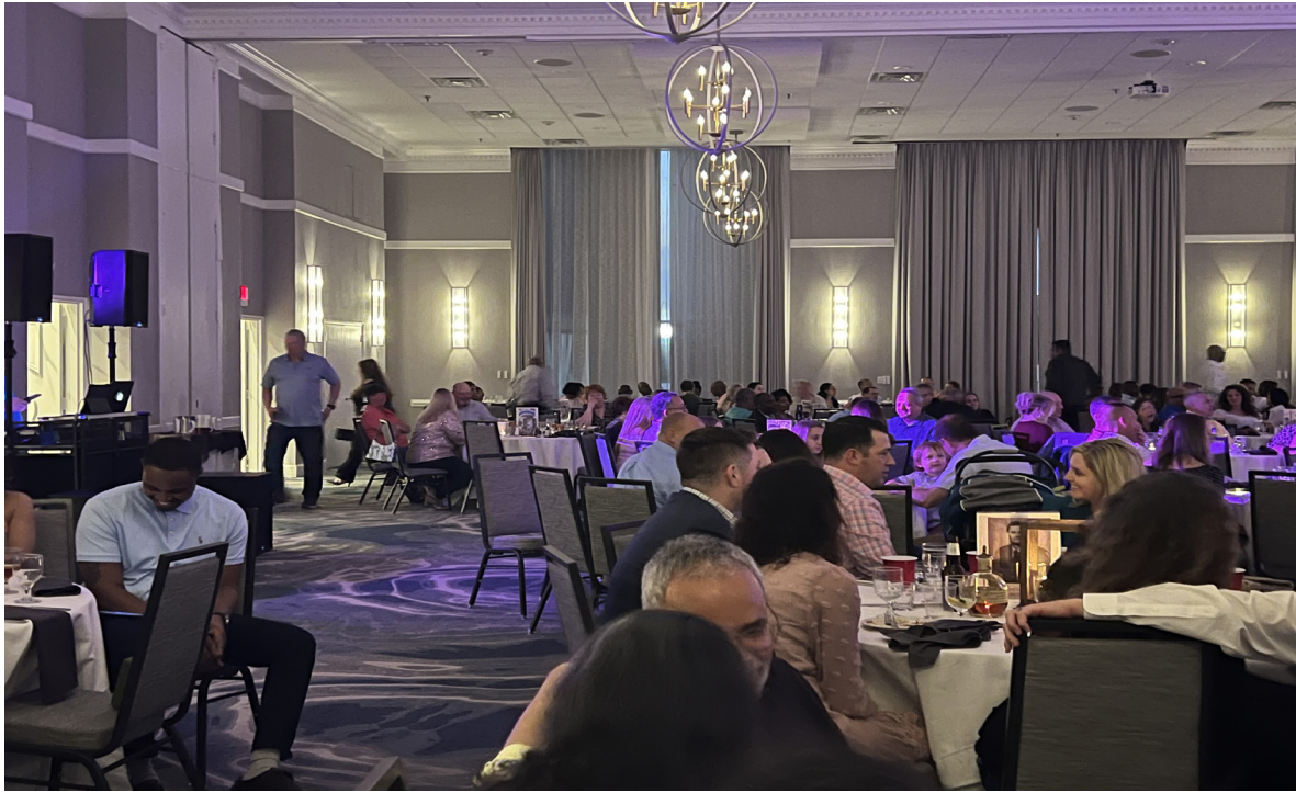
Members of the NCSGA enjoying Saturday night dinner and socializing