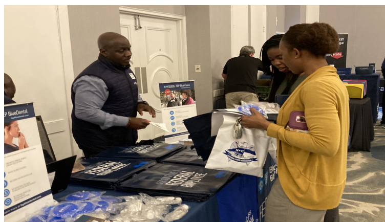
Association Members meet and greet with Corporate Members from Blue Cross and Blue Shield at the NCNGA Convention