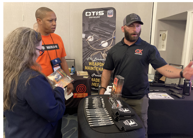
Association Members meet and greet with Corporate Members from Conflict Kinetics at the NCGA Convention

merger is complete, the foundation will have over $800,000 funds available for scholarships. Long term investments are at 4 million dollars, with the ability to retrieve 4% to balance the budget for $170,000 for internal revenue this year. The committee then voted and approved of the FY 2022-2023 budget.