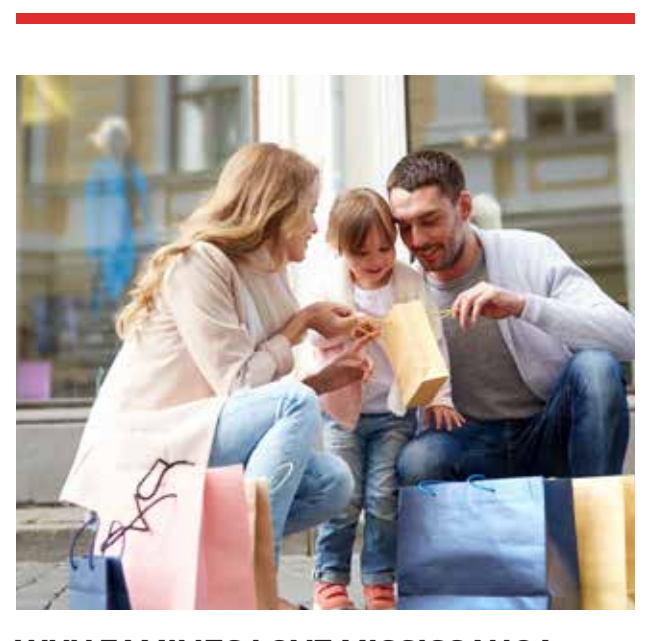
WHY FAMILIES LOVE MISSISSAUGA