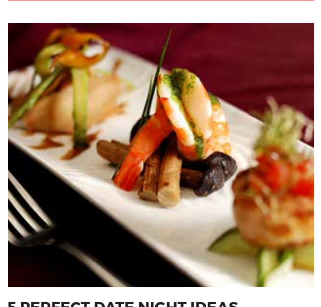
5 PERFECT DATE NIGHT IDEAS ...