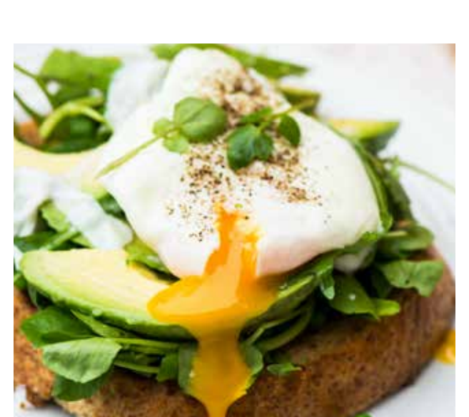
HIDDEN TREASURES IN SCARBOROUGH