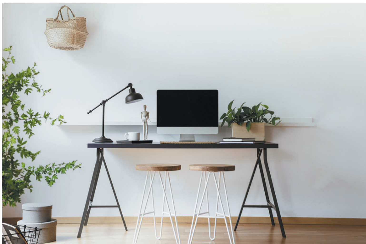
Foerni, a furniture leasing company in Hong Kong, rents out standing desks — one of the most popular items among its customers now working from home because of the pandemic.