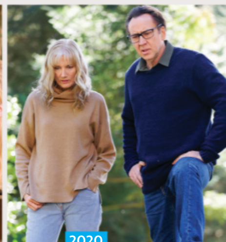
National Treasure: Book of Secrets