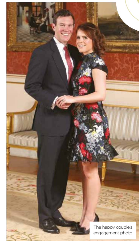
The happy couple's engagement photo

Kate and Harry and Meghan have done in the past. The special photographs were taken within Buckingham Palace, which provided a beautiful backdrop. The happy couple smiled for the cameras and showed off Eugenie's beautifully fashioned engagement ring. One of the special images even featured on Princess Eugenie's Instagram account – did you know she's one of the only royals to have her own personal Instagram account?