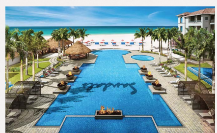
Sandals Royal Barbados, Barbados sandals.com

There's a keycard with your name on it at one of these so-new-the-paint's-still-drying love nests