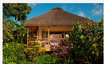
Zuri Zanzibar, Zanzibar zurizanzibar.com