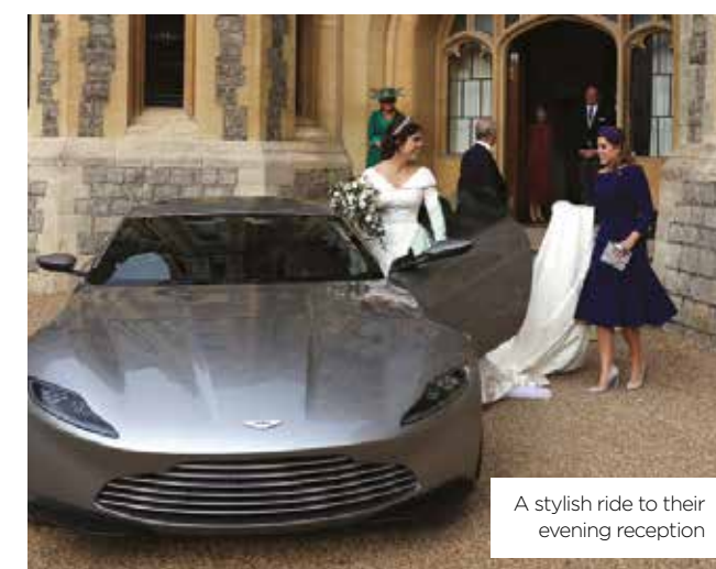
A stylish ride to their evening reception