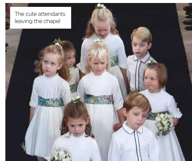
The cute attendants leaving the chapel