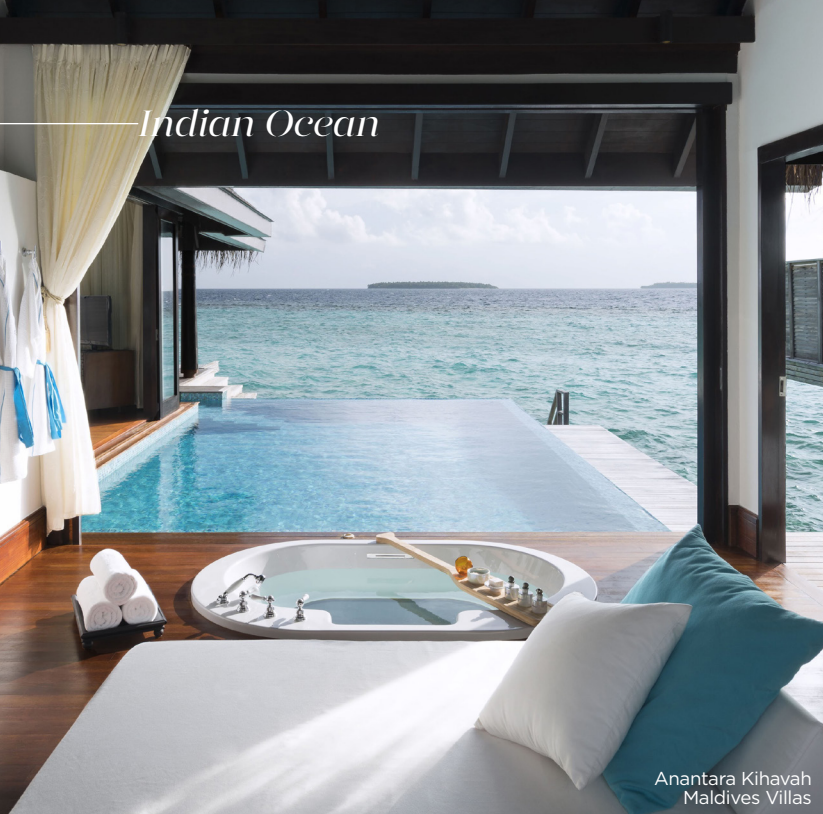
Anantara Kihavah Maldives Villas