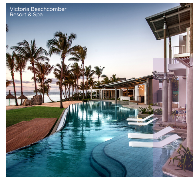
Victoria Beachcomber Resort & Spa