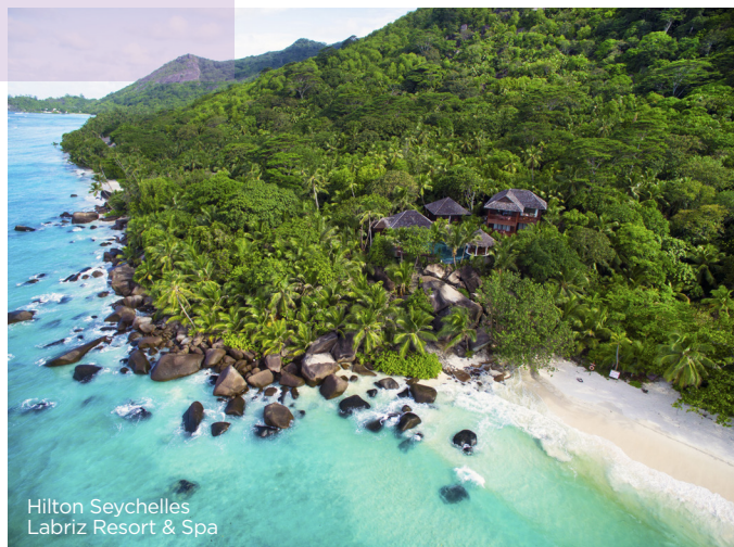
Hilton Seychelles Labriz Resort & Spa

using massage techniques, natural scrubs and tropical rain showers to get you feeling totally zen. From £2,938pp for four nights in an Ocean View Pool Villa, based on two sharing, for holidays in 2019. Includes breakfast, economy flights with Qatar Airways from London Heathrow, and private transfers to and from the resort. Extra nights are from £441pppn. kuoni.co.uk