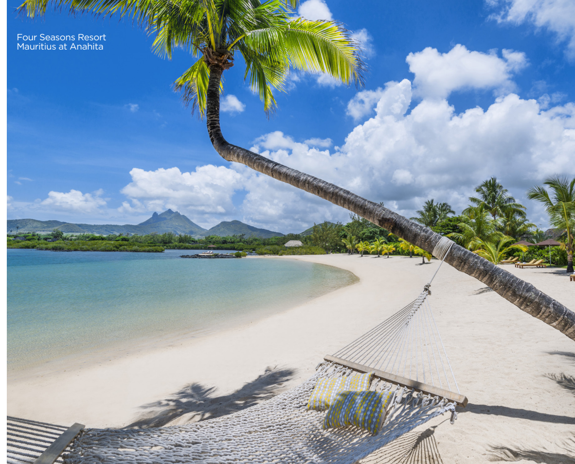
Four Seasons Resort Mauritius at Anahita

Home to a spectacular overwater spa, four amazing restaurants and 136 blissful rooms, all with an ocean backdrop that lives up to the brochures, this is the epitome of paradise. With endless things to see and do, your honeymoon schedule can be as jam-packed or relaxed as you like – the choice is yours. Staff are on hand to give you a game or two of tennis, and you can't leave without saying hello to the resident giant tortoises! From £2,135pp*, staying in a Garden Pool Villa on a half-board basis, includes economy flights and private transfers, based on two adults sharing, inspiringtravelcompany.co.uk