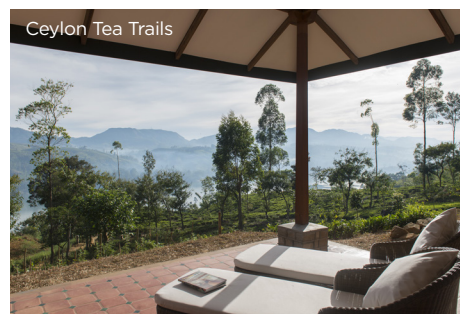
Ceylon Tea Trails

This intimate resort has just five classic bungalows, each with its own personal butler. You'll be torn between soaking up the home-from-home atmosphere at the resort or getting out to explore the surrounding area. With whitewater rafting, hiking and mountain biking all on the agenda, we suggest you embark on a day of activities and top it off with an in-room massage and tantalising Sri Lankan cuisine on the terrace. From US$758pm (approx. £575) on a fully inclusive basis, based on two sharing, includes daily breakfast, lunch, afternoon cream tea, pre-dinner cocktails, dinner, soft and alcoholic beverages, a Tea Experience and all taxes and service charges. respndentceylon.com/teatrails