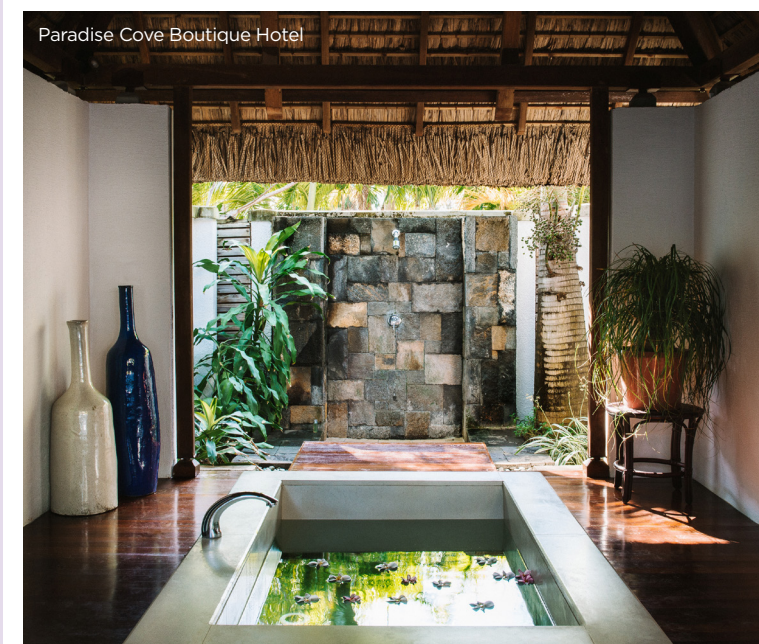
Paradise Cove Boutique Hotel

the stuff honeymoon dreams are made of. The 'you&me' concept here is all about creating special memories together – whether that's checking in at the open-air spa or simply going on an afternoon of cycling. From £3,989** for two people, for a seven-night stay on an all-inclusive basis in a Deluxe Premium Room with return Emirates flights, emiratesholidays.com