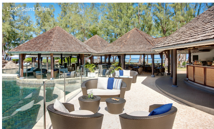
LUX* Saint Gilles

over Réunion's active volcano, and take to the ocean in an Instagram-worthy clear kayak. In signature LUX* style, if you find a message in a bottle on the beach, it could be your ticket to a complimentary massage, a scuba-diving lesson or even dinner on the beach! From €392pm (approx. £350) on a B&B basis in a Superior Room, luxresorts.com