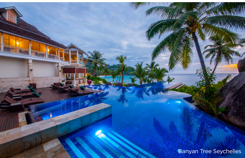
Banyan Tree Seychelles