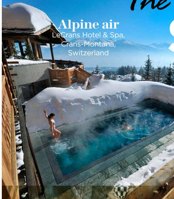
Alpine air LeCrans Hotel & Spa, Crans-Montana, Switzerland

In our humble, but expert, opinion, there's nothing like a luxe spa if you want serious R&R – and we have some beauties for you to choose from in this stunning selection. From an invigorating hot pool overlooking the Swiss mountains to the vibrancy of a Moroccan retreat, we've got a wellness heaven that will suit everyone's taste.