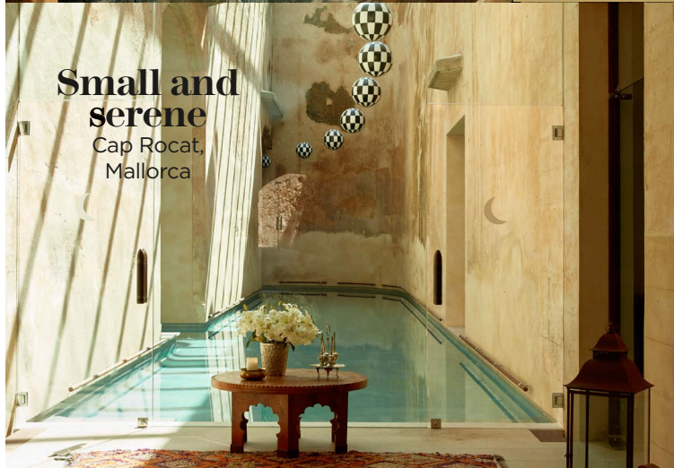
Small and serene Cap Rocat, Mallorca