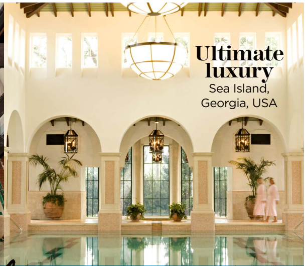
Ultimate luxury Sea Island, Georgia, USA