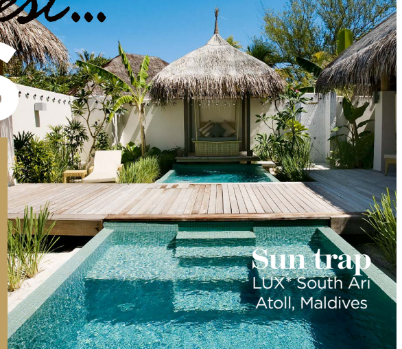
Sun trap LUX* South Ari Atoll, Maldives

In our humble, but expert, opinion, there's nothing like a luxe spa if you want serious R&R – and we have some beauties for you to choose from in this stunning selection. From an invigorating hot pool overlooking the Swiss mountains to the vibrancy of a Moroccan retreat, we've got a wellness heaven that will suit everyone's taste.