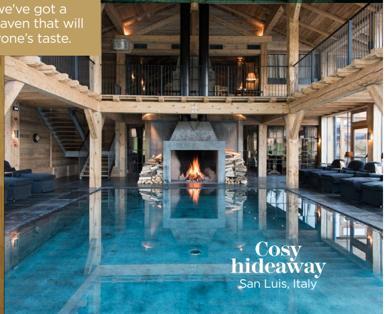
Cosy hideaway San Luis, Italy