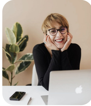
property & project managers