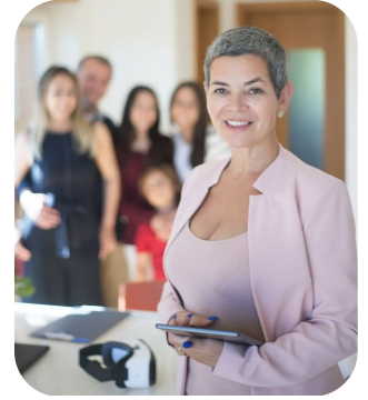
real estate agents