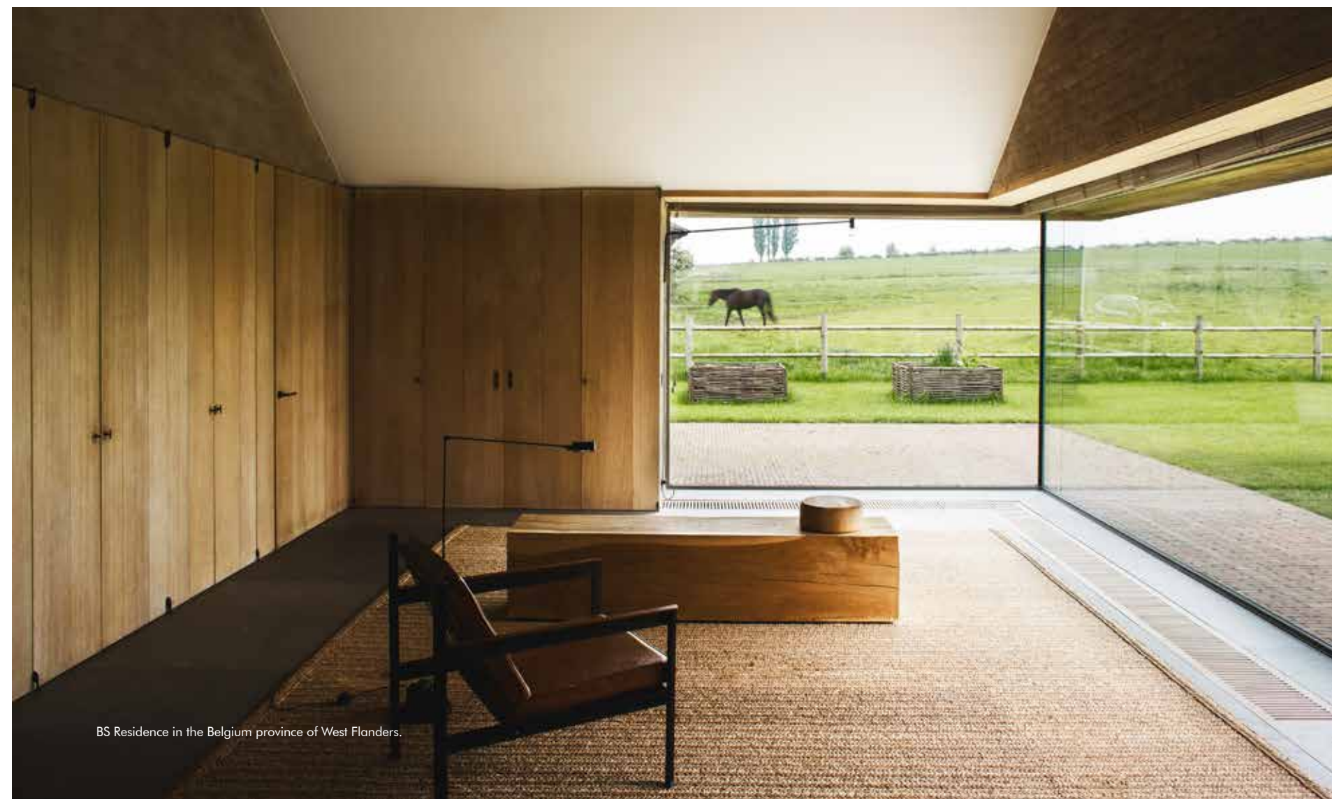
BS Residence in the Belgium province of West Flanders.