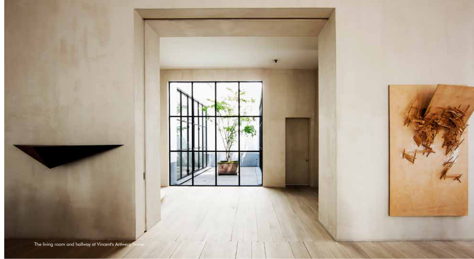
The living room and hallway at Vincent’s Antwerp home.