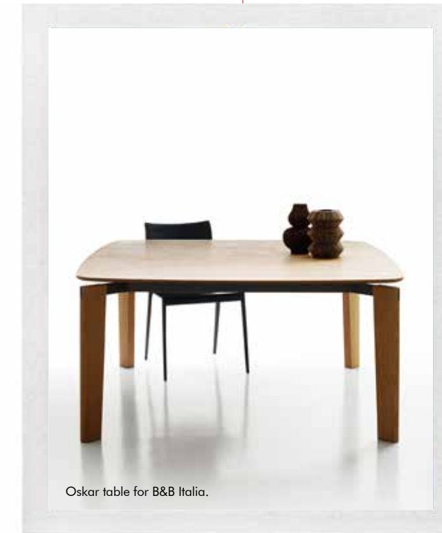
Oskar table for B&B Italia.

Does he ever feel the pressure to perform or deliver the signature Van Duysen look? In a word, no. “I know myself and I know how to protect myself,” he says. He avoids the media, except when it’s to share his vision with people who admire his work. And, of course, meek old Antwerp keeps him grounded. “We’re individualists here and we’re all different,” he says. “You can see it in the fashion people, the artists, painters, dancers, actors, architects...there is an enormous degree of talent and we’re all workers. We are really focussed and we love what we’re doing and we like to share it with people. But we’re all very humble. We’re very discreet and I think that makes us, Belgium, a little bit different.” ✱