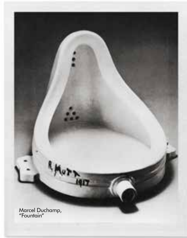
Marcel Duchamp, "Fountain"