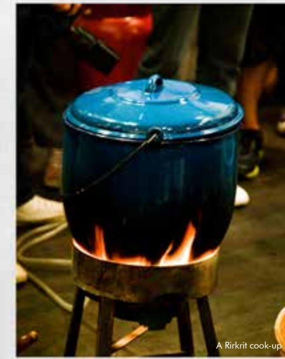
A Rirkrit cook-up