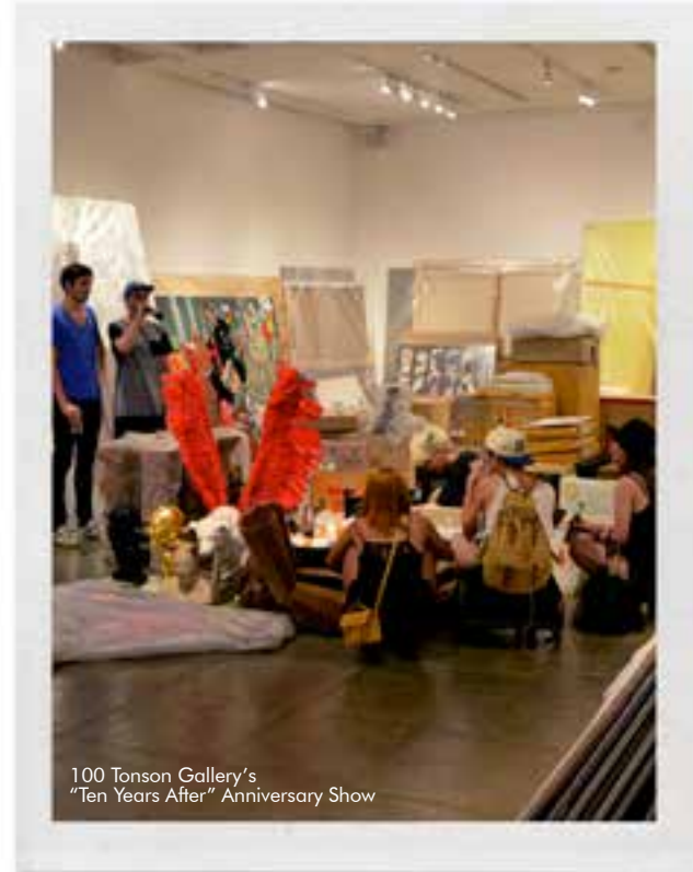
100 Tonson Gallery's "Ten Years After" Anniversary Show

he discovered the museums of art, as so many do, but from the get-go he was never interested in slotting neatly into that scene. “In New York I was never engaged in trying to make Western art – I was always asking myself, ‘What will I do when I come back to Thailand?’, ‘what will it mean to make art there?’”