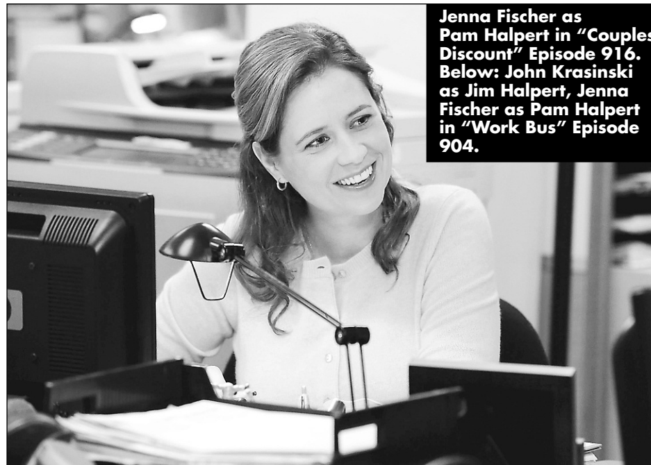
Jenna Fischer as Pam Halpert in "Couples Discount" Episode 916. Below: John Krasinski as Jim Halpert, Jenna Fischer as Pam Halpert in "Work Bus" Episode 904.

I took all of Pam's jewelry—the stuff I wore every day. Her wedding ring, necklace, earrings,