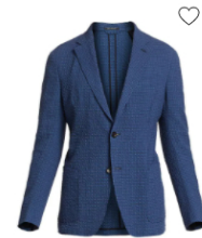
Ermenegildo Zegna Seersucker Sportcoat CAD 2,636.57 CAD 1,318.27