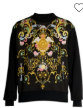
Versace Jeans Couture Color Baroque Crewneck Sweater CAD 389.87