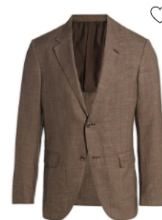
Ermenegildo Zegna Sharkskin Wool Suit Jacket CAD 3,429.53