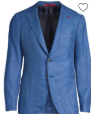
Isala Summertime Solid Wool, Silk & Linen Single-Breasted Jacket CAD 4,889.88 CAD 2,444.92 - CAD 2,444.94