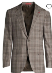
Isala Delain Plaid Wool Single-Breasted Jacket CAD 4,427.33 CAD 2,213.66