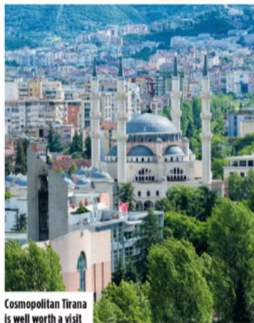
Cosmopolitan Tirana is well worth a visit

The jewel in the Riviera's crown, though, is Ksamil: its best beaches include Bora Bora, with pebbly white sand, the aptly-named Paradise and Beach Number 7, with crystal-clear water and kayaks for hire if you want to explore the nearby islands. Base yourself at Vlorë's stylish, beachfront