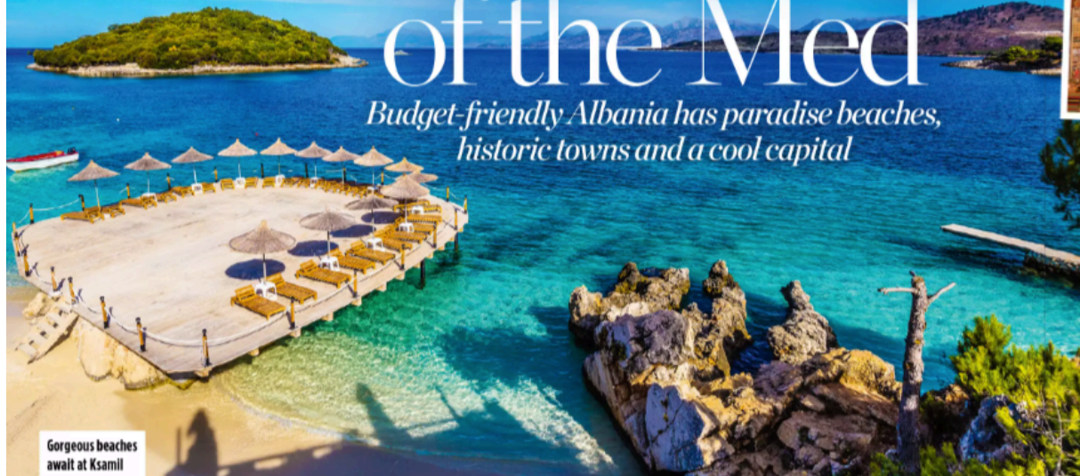
Gorgeous beaches await at Ksamil

Budget-friendly Albania has paradise beaches, historic towns and a cool capital