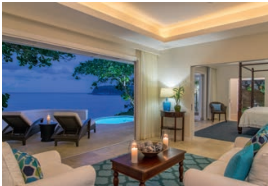
SUITE AS SUGAR: [left] A view from one of the private rooms at Jamaica Inn in Ocho Rios, Jamaica

St Kilda was given its name in 1841 by Superintendent La Trobe who was inspired after watching a boat named the 'Lady of St Kilda' anchor off the beach