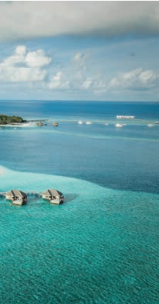
A ROOM WITH A VIEW: [above] Private overwater villas at the Conrad Rangali Maldives hotel