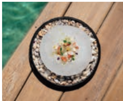
REVEL MOON: [from top] The Topsy Unicorn beach club in Singapore; a dish at SantAnna Mykonos