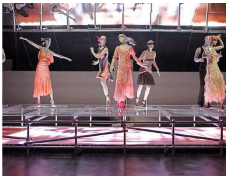
NATIONAL GALLERY OF VICTORIA