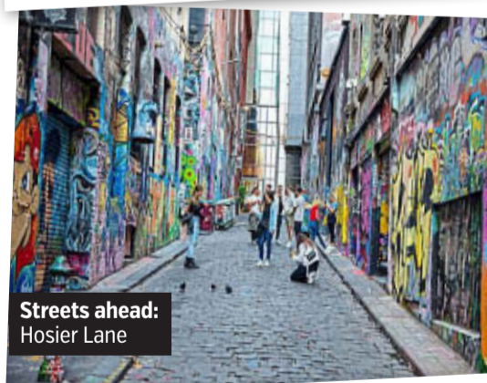
Streets ahead: Hosier Lane