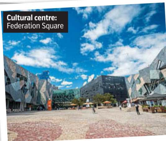
Cultural centre: Federation Square