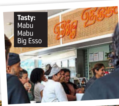
Tasty: Mabu Mabu Big Esso

Rooms at Voco Melbourne Central from £142pn, ihg.com . For more information, go to visitvictoria.com and visitmelbourne.com