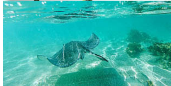
Ray of hope: Meet the friendly inhabitants at Stingray City (above) and enjoy the colours of the annual carnival (below)