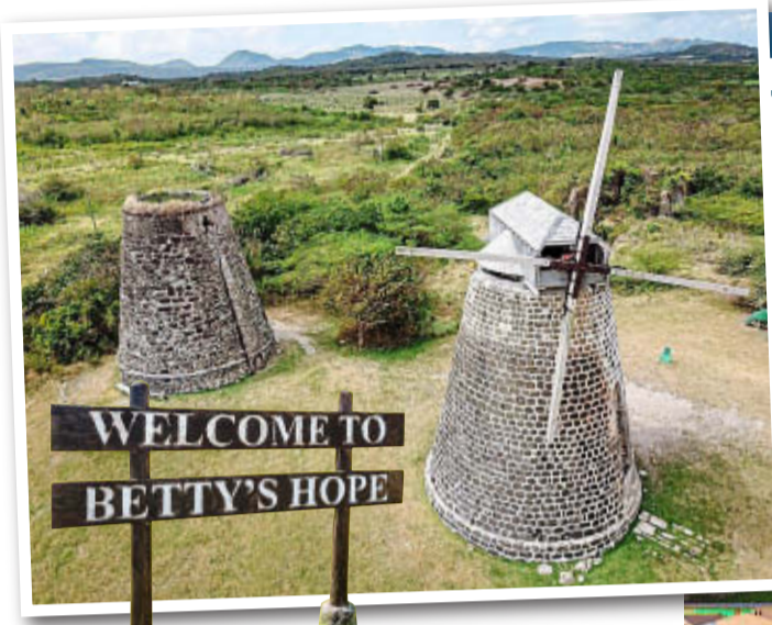
Port of call: Capital St John's and (left) Betty's Hope sugar plantation