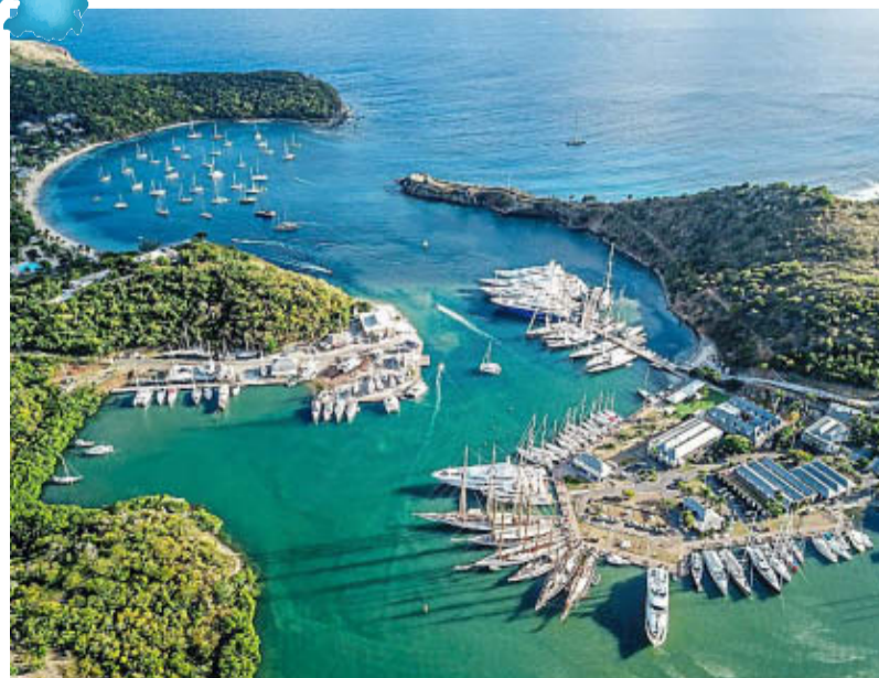
Admirable: Nelson's Dockyard is a renowned cultural heritage site in Antigua

More peaceful is Dickenson Bay, with its dazzlingly white sandy beach, turquoise waters and old sugar cane plantations, while Falmouth and St Philip are both small, gentle, quiet coastal towns. Just don't forget that laptop charger.