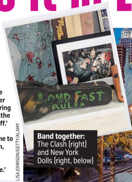
Band together: The Clash (right) and New York Dolls (right, below)

Fired up, I head to nearby Area 15, another recent addition to the Vegas entertainment scene which jerks me from the punk era into the rave one, as it's covered in fluorescent paintings and thrums