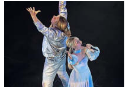
Hot stuff: Forest Lagoon (left), the Húsavík-set The Story Of Fire Saga (above) and Jaja Ding Dong bar (below)