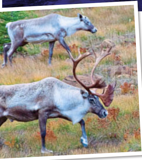
MAJESTIC: Caribou in Gros Morne National Park and, above, the park's fjord

size to Bulgaria), with a population of 500,000. Villages and towns are spread out and there's a great sense of space where I feel I can truly breathe.