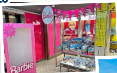
Clockwise from left: A P&O Barbie booth; Cadiz topped a hidden gems poll; A-Rosa Sena's kids' club

Obsessed by Barbie? At new family zones on P&O Cruises' ships Arvia