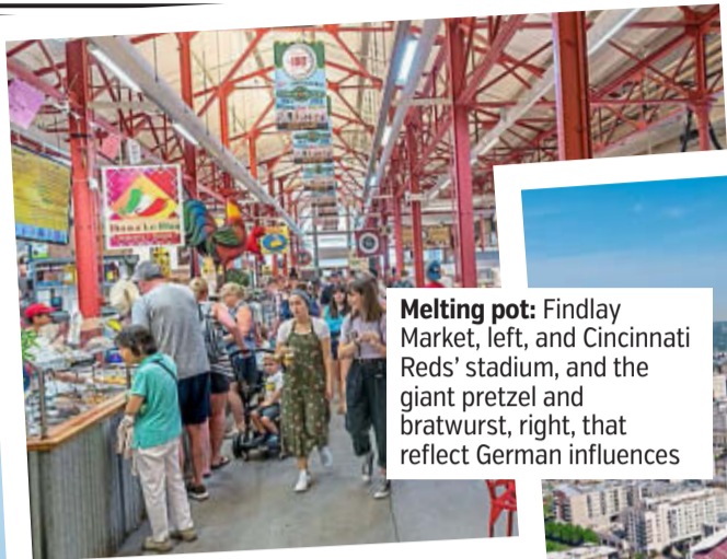
Melting pot: Findlay Market, left, and Cincinnati Reds' stadium, and the giant pretzel and bratwurst, right, that reflect German influences