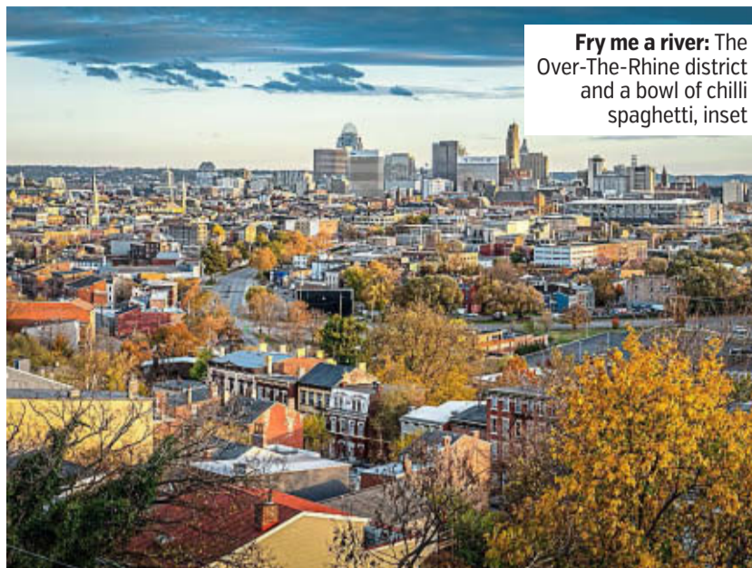
Fry me a river: The Over-The-Rhine district and a bowl of chilli spaghetti, inset

and Iona, there are life-sized Barbie photo booths and fancy-dress costumes to try on. pocruises.com