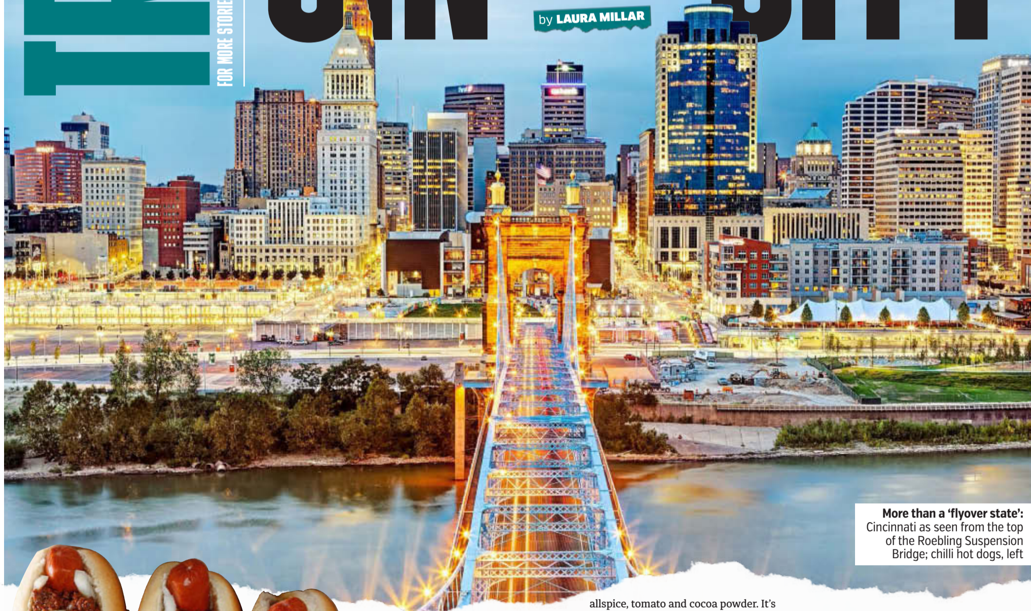
More than a 'flyover state': Cincinnati as seen from the top of the Roebling Suspension Bridge; chilli hot dogs, left