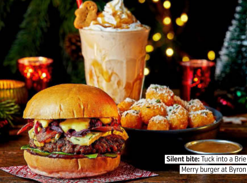
Silent bite: Tuck into a Brie Merry burger at Byron