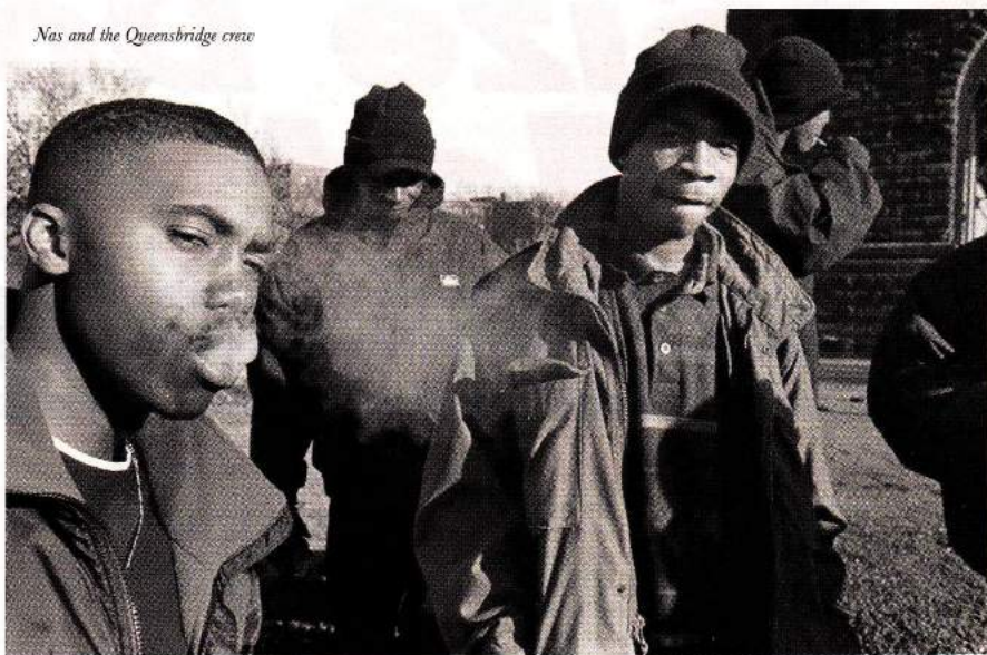
Nas and the Queensbridge crew

"Every word that was spit came from something that happened... Every word was happening all around us."