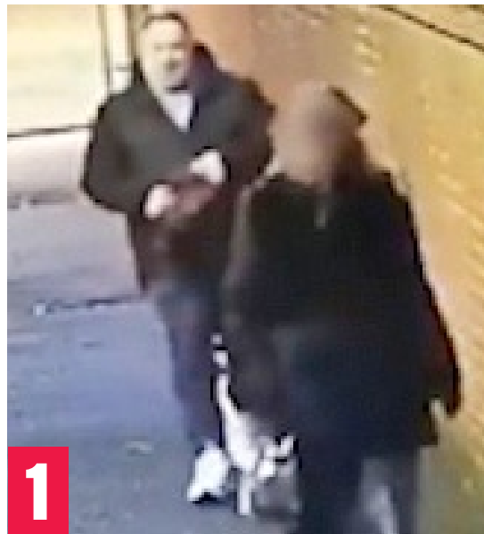
1 Danger: Following his victim into the alley