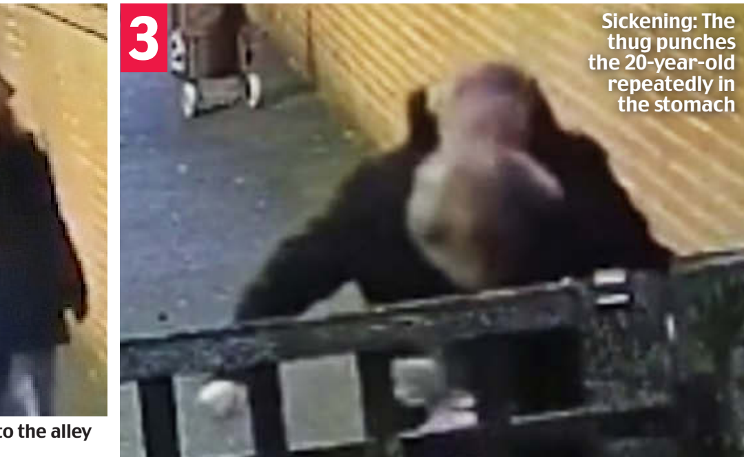
3 Sickening: The thug punches the 20-year-old repeatedly in the stomach