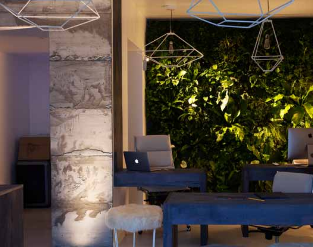
His lighting designs, in particular, catch the eye

Property Awards, and the canvas of cool greys and concrete with sheepskin stools against an added punch of natural greenery is full of personality.