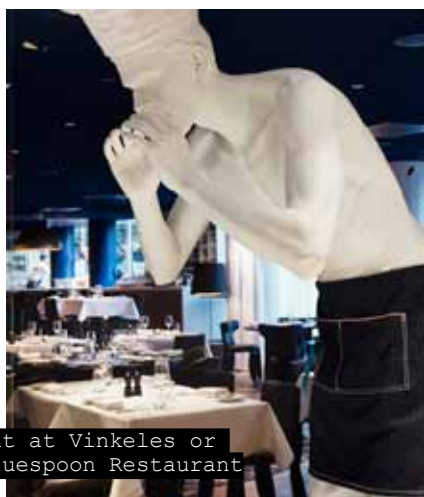
Eat at Vinkeles or Bluespoon Restaurant