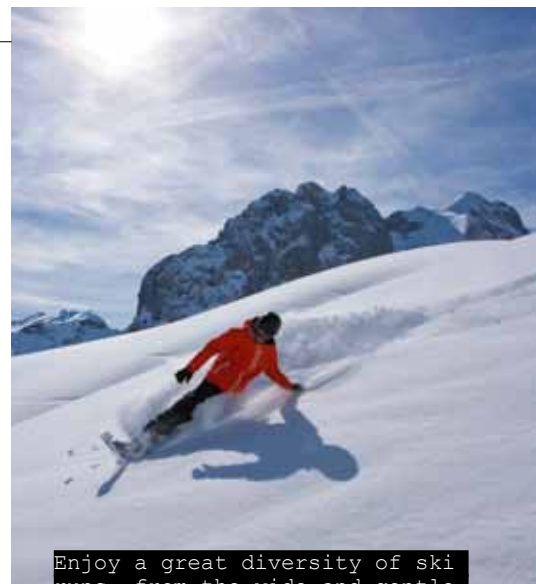
Enjoy a great diversity of ski runs, from the wide and gentle to powdery mountain tops

Gstaad is one of the top cross-country ski areas in the Alps and is also popular with hikers, but the hipsters are into snow biking, where you head up to dedicated tracks to tackle the snow on fat-tired mountain bikes. It's hard work on the uphill, but fun on the downs and the scenery is beautiful. While up on the snow-biking trails of Sparenmoos, we also rediscovered a childhood winter pastime that had us all in stitches – sledging. Carved out around the snow