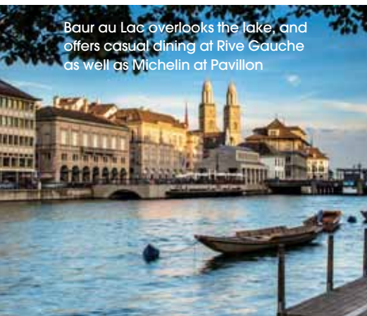
Baur au Lac overlooks the lake, and offers casual dining at Rive Gauche as well as Michelin at Pavillon

Kameha Grand Zurich offers double rooms from £136 per night. See kamehagrandzuerich.com