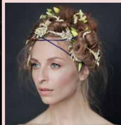
Understated chic, above, and the statement head piece, left, and below, the hair stencil trend

1 For understated, Jil Sander-style chic, try a deep side parting and use a velvet ribbon to tie back a low ponytail, or be inspired by Chanel and recreate their recent revival of velvet headbands combined with a lot of backcombing for a modern beehive.