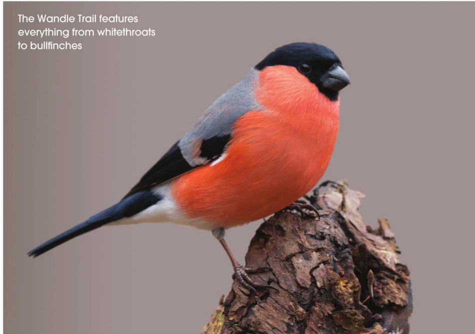
The Wandle Trail features everything from whitethroats to bullfinches

their caffeine fix at Coffee in the Wood, an excellent family-run coffee shop with cakes, traybakes and various other creations from local artisan bakery Leila's Place. Treats like the gluten-free chocolate sponge and summery lemon and blueberry cake are also available at Bliss in nearby South Wimbledon, which also has great coffee and is just next to the Polka Theatre. While the Polka is dedicated exclusively to shows and workshops for children, there's also the Grade II-listed Colour House theatre, complete with a