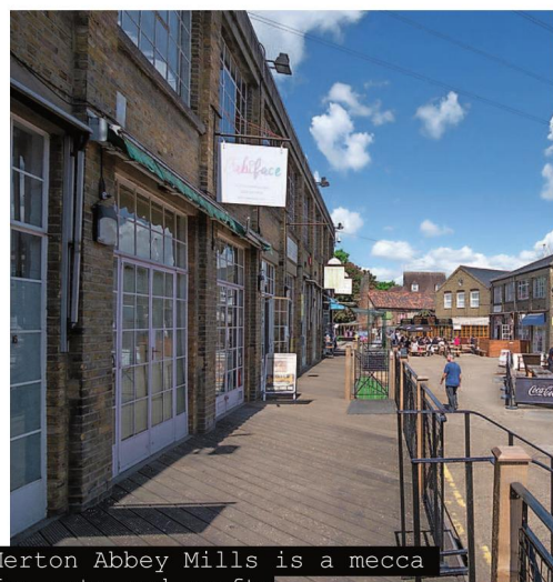
Merton Abbey Mills is a mecca for arts and crafts