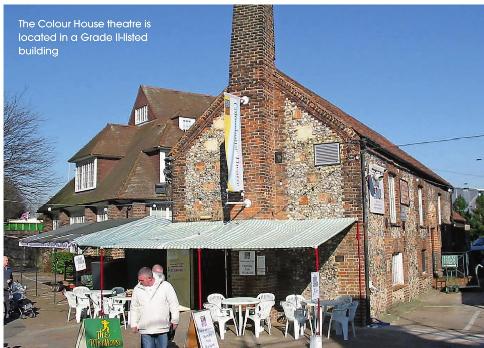
The Colour House theatre is located in a Grade II-listed building