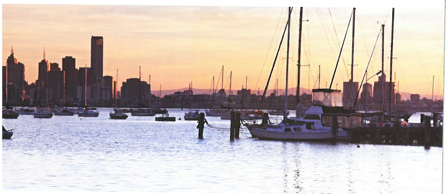
Melbourne at dawn. Viewed from Williamstown.