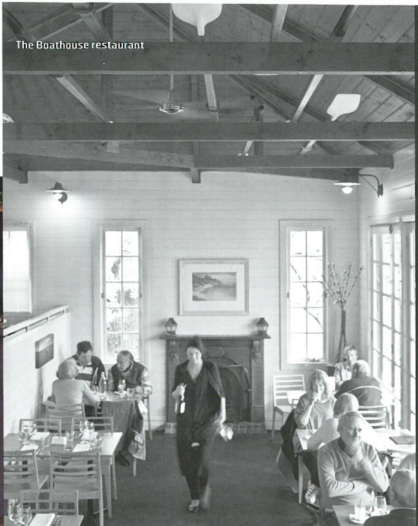
The Boathouse restaurant